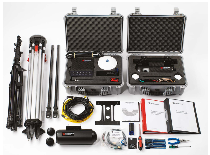
Component parts of the Routescene UAV LiDAR solution